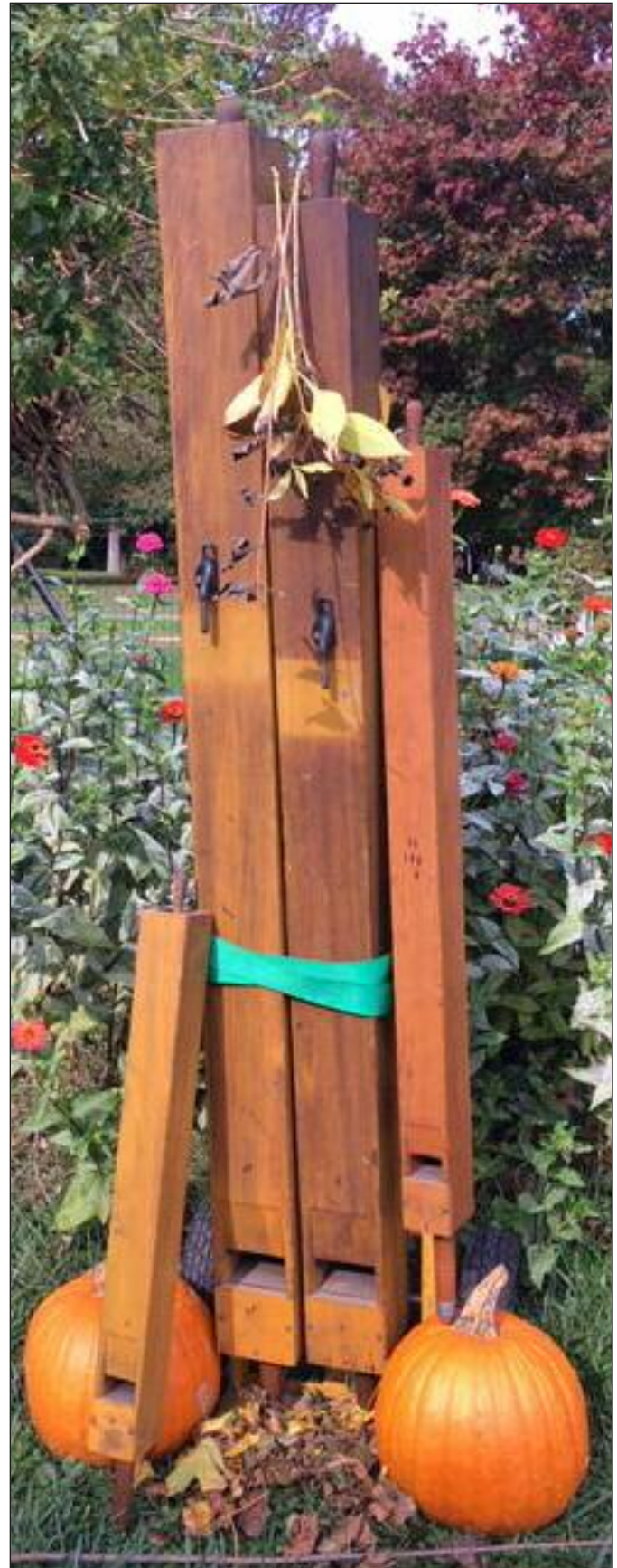
Autumn Pipes - MEC